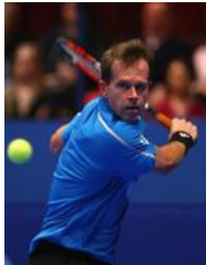
Swedish tennis star Stefan Edberg.

Stefan Edberg won six Grand Slam singles titles thanks to an aggressive serve-and-volley style. The Swede is taking a more careful approach when it comes to investing as he bets on bonds.